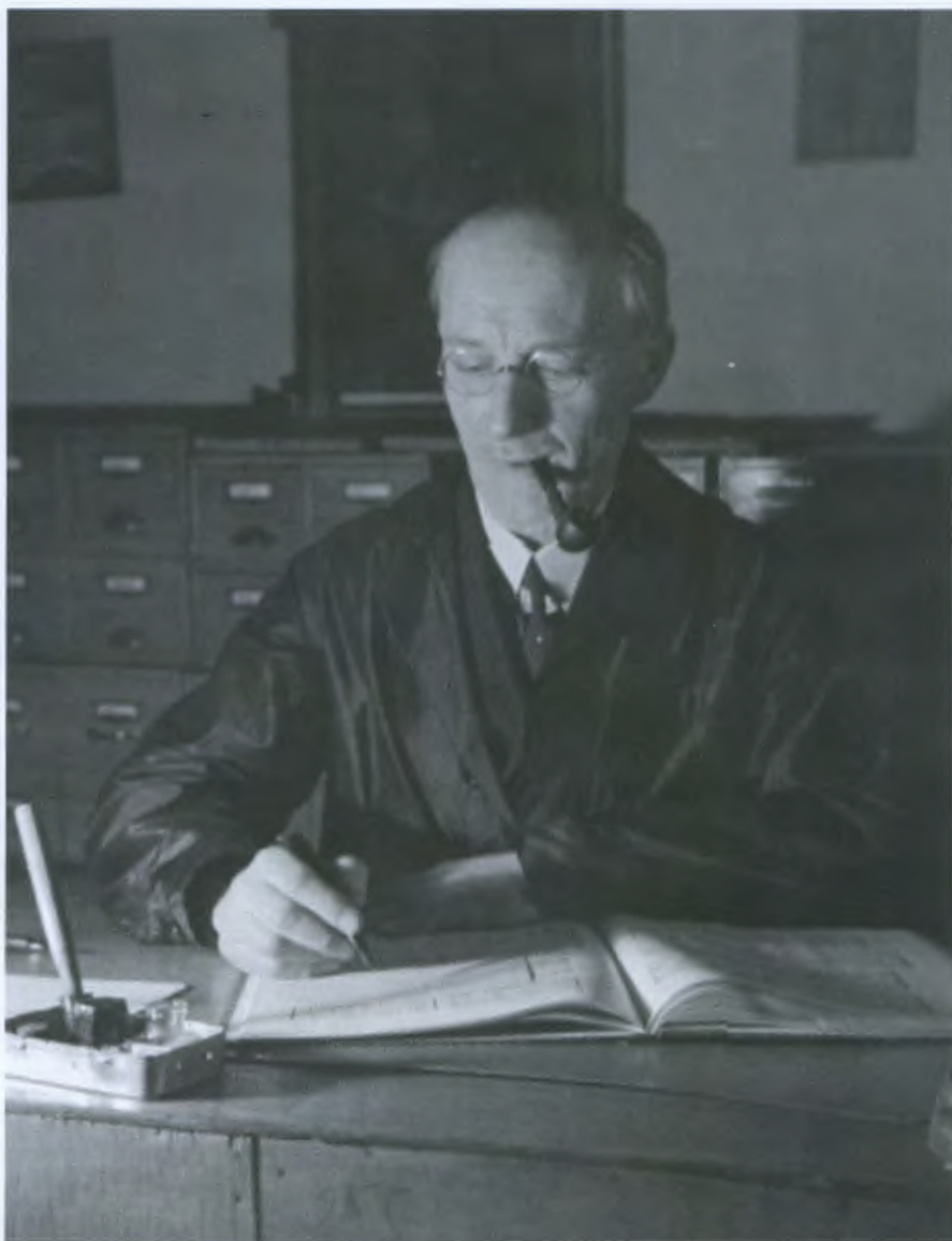
Ladislav Vycpálek, circa 1942

Both are reasonable questions. The first question is easily answered—the Czech composer's name is pronounced "Vitz-pa-leck." The second question led to the main impetus behind this article, as violists should be aware of this piece in the repertoire. Vycpálek's exotic Czech name and somewhat obscure status may help explain why violists in America are unaware of this piece. But if they look beyond the composer's intimidating name, they will discover a true